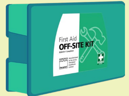
Off-Site Lone Worker Kit

This kit can be crucial in the event of road crashes, as well as other serious mishaps such as cuts, scrapes and burns