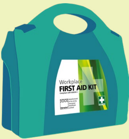
Workplace First Aid Kit

Stocked with essential items to ensure that injured employees get the right help before things get too serious