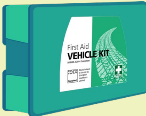
First Aid Vehicle Kit

Stocked with essential items to ensure that injured employees get the right help before things get too serious