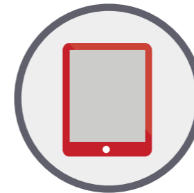
Tablets, electronic medical record equipment