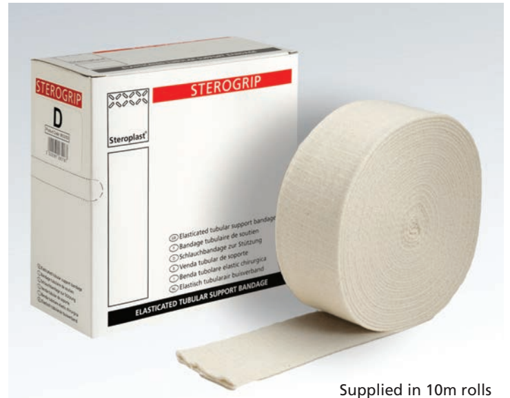
Supplied in 10m rolls