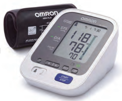
Monitor Cuff - Large (Ref WSTE0111)